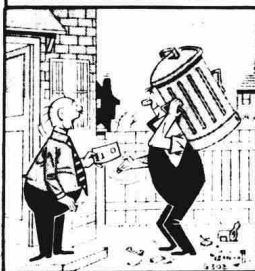
"There—now you can revert to your usual grumpy self for another year!"