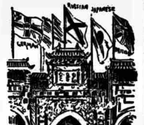
THE NEW GRAND-BUILDING IN TOWN.