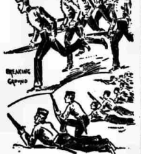
THE HOME-COMING OF A DERBYSHIRE HERO.