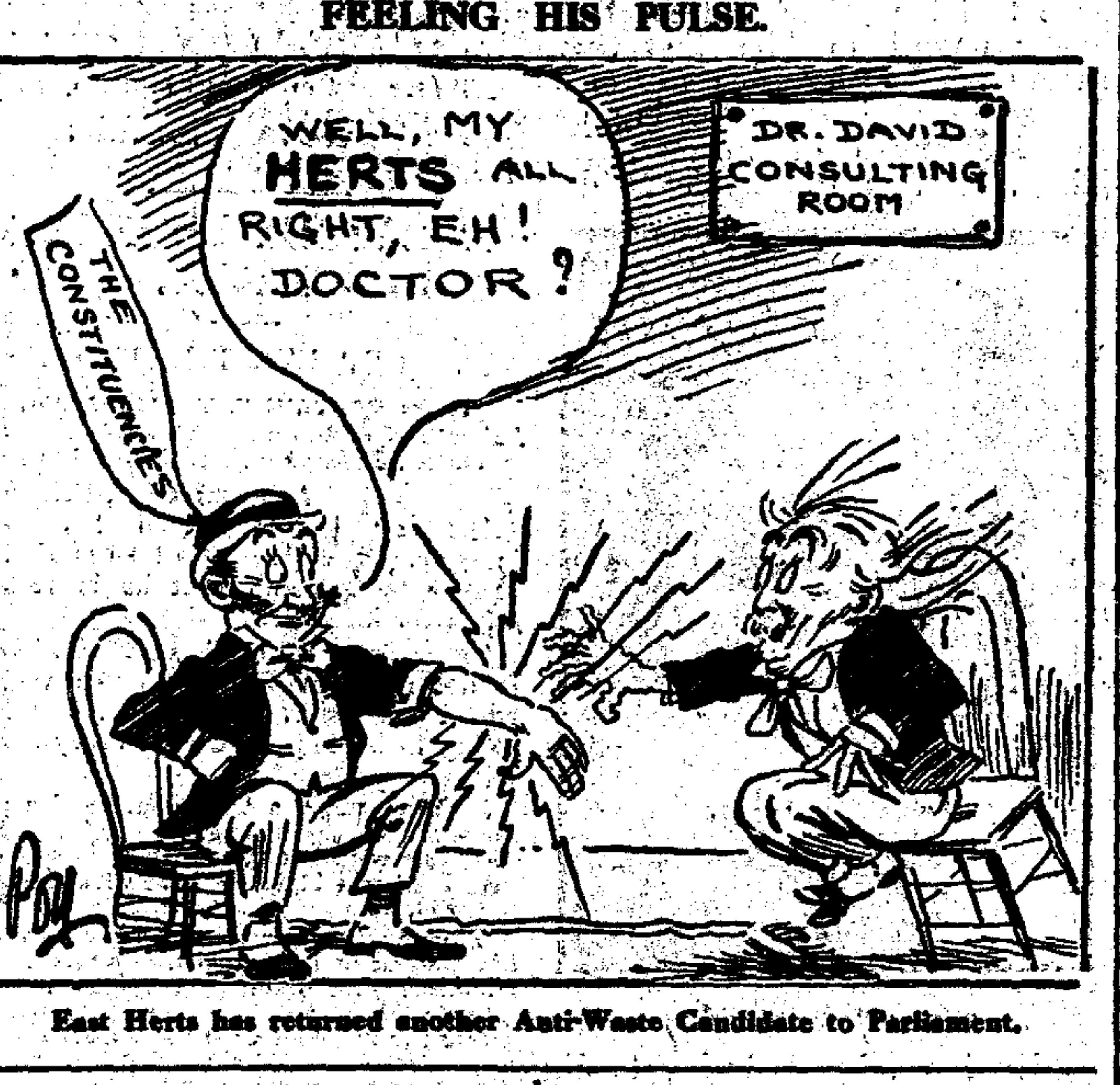
East Herts has returned another Anti-Waste Candidate to Parliament.